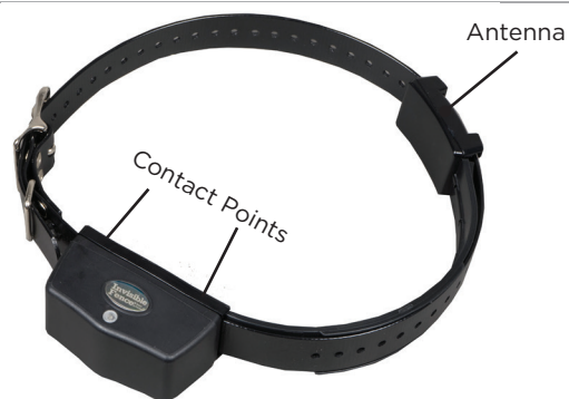
GPS 3.0 Mobile Collar Unit