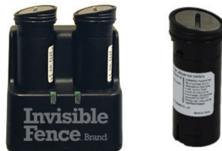
GPS Battery Charger and Battery Module